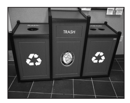
Central Carolina Technical College uses customized collection containers for its recycling program.

The Act requires the S.C. Department of Health and Environmental Control (DHEC) to make recommendations in the S.C. Solid Waste Management Annual Report on ways solid waste management can be improved.